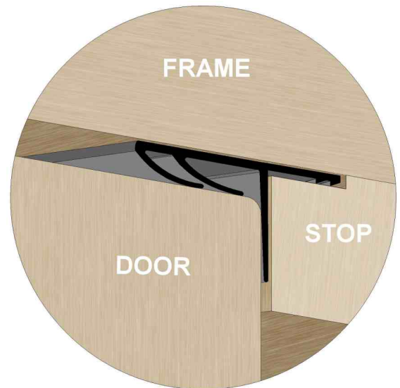
NOR 710SR In-Situ